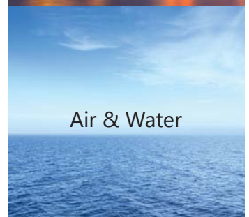
Air & Water