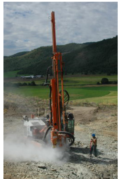
Blast hole rig